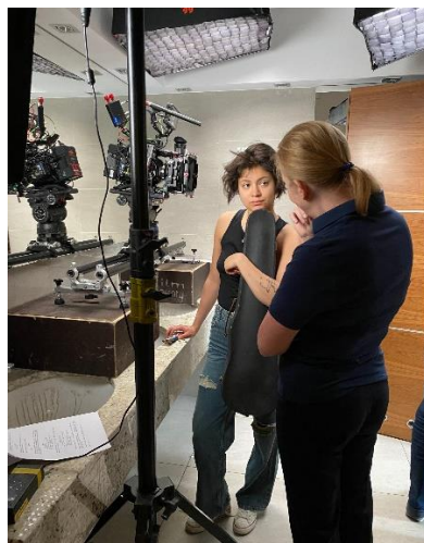
GLORIOUS BODIES WOUNDED SOULS by Raphaela Wagner from Switzerland