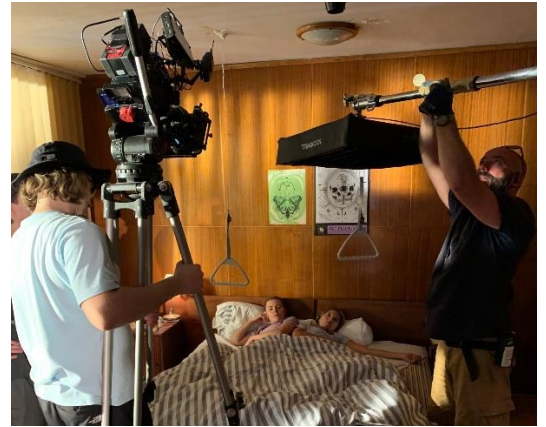
INSEPARABLE by Adelina Borets from Ukraine/Poland