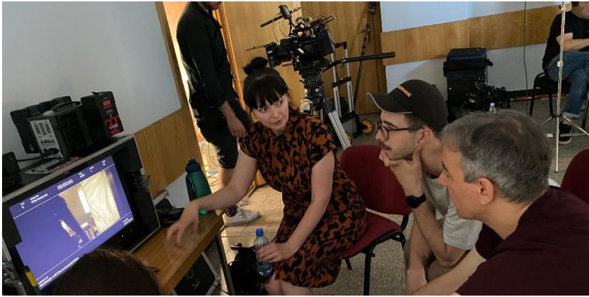
Behind the scenes - MIRROR OF NIGHTINGALES by Karla Lulić from Croatia